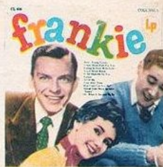
FRANKIE Frank Sinatra, Doris Day. CL 606—Extended Play B-1984, B-1985, B-1986