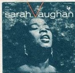
AFTER HOURS Sarah Vaughan. CL 660—Extended Play B-490