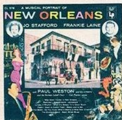
A MUSICAL PORTRAIT OF NEW ORLEANS Jo Stafford and Frankie Laine with Paul Weston and his Orchestra. CL 578—Extended Play B-342