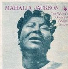
MAHALIA JACKSON The World's Greatest Gospel Singer The World's Greatest Gospel Singer and The Fall-Jones Ensemble. CL 644—Extended Play B-492, B-1995